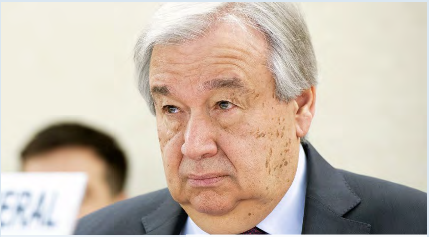
UN Secretary-General António Guterres attends the High Level Segment of the 43rd Regular Session of the Human Rights Council in Geneva.