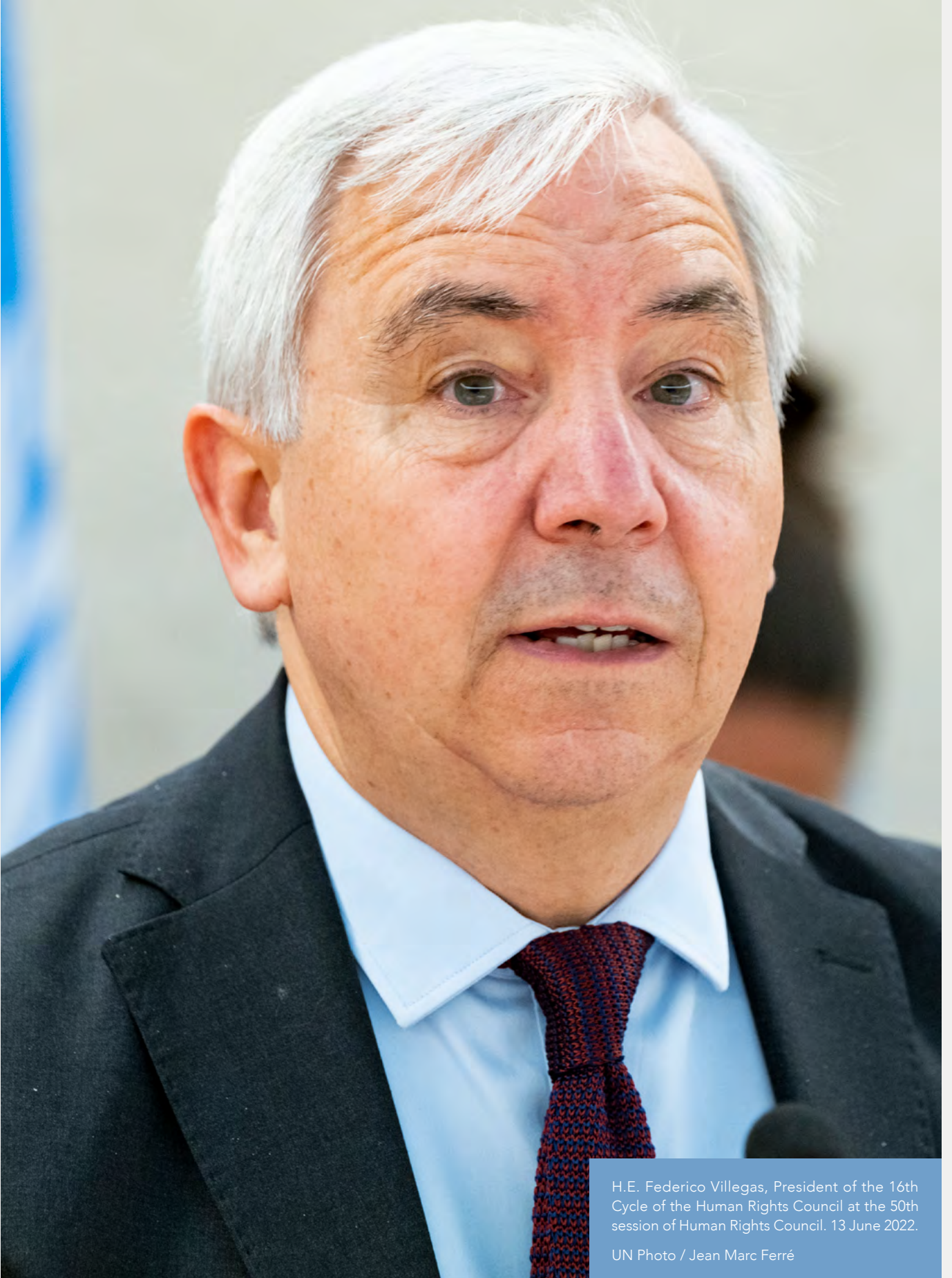
H.E. Federico Villegas, President of the 16th Cycle of the Human Rights Council at the 50th session of Human Rights Council. 13 June 2022.