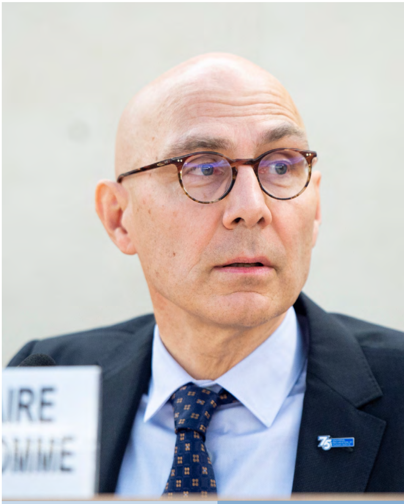
Volker Türk, United Nations High Commissioner for Human Rights addresses the 52nd Regular Session of the Human Rights Council, Geneva.